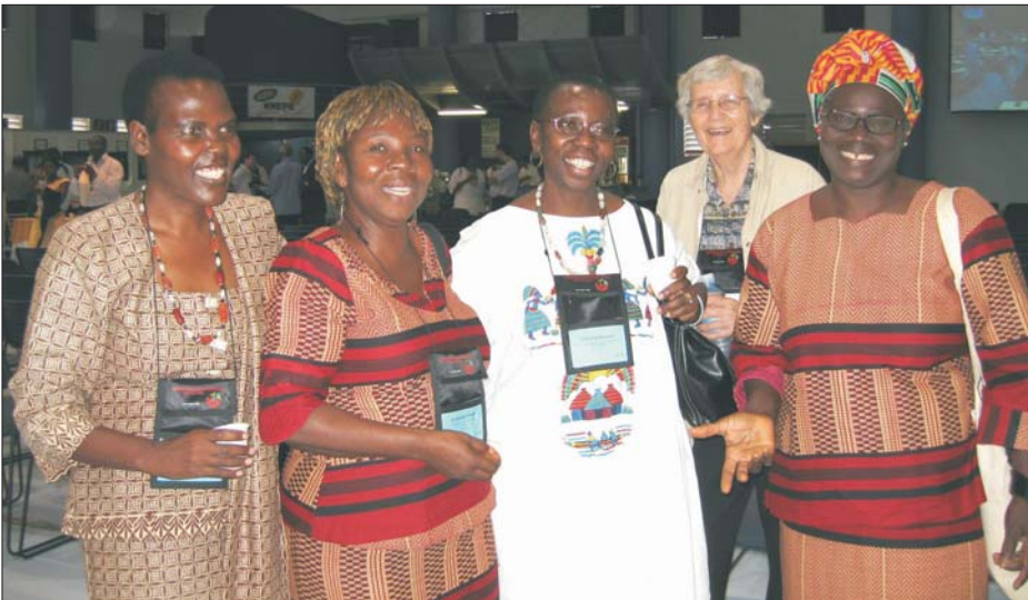
Circle members at the 9 th Assembly of the World Council of Churches in Porto Alegre, Brasil.

religions rooted in African Indigenous Religions, Christianity, Islam and Judaism. It encompasses indigenous African women and seeks to relate to African women of American, Asiatic, and European origins. These concerned women are engaged in theological dialogue with cultures, religions, sacred writings and oral stories that shape the African context and define the women of this continent.